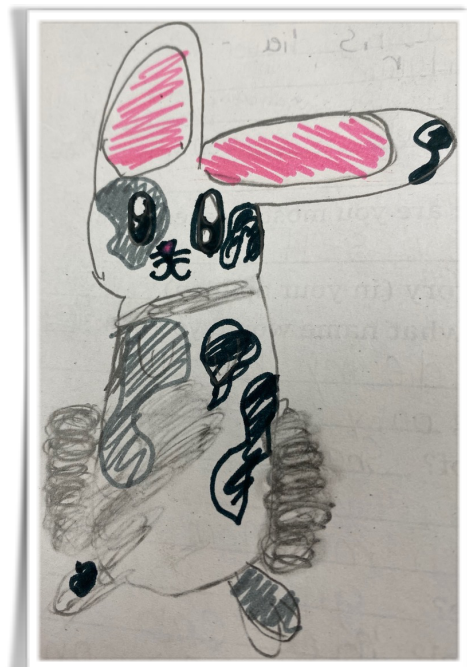
"Bunny with a Big Tail"

Favorite hot lunch: Grandma Laura's mushroom ice cream