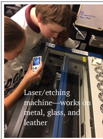
Laser/etching machine—works on metal, glass, and leather

different caps, shirts, coats, etc. at once. It shows on the screen where it is in the process of