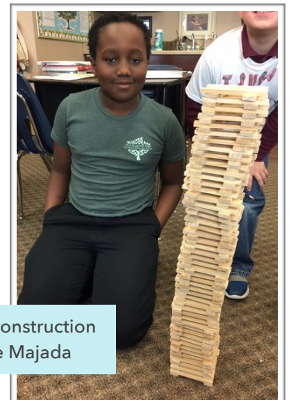
Contraptions Construction By Fortunate Majada