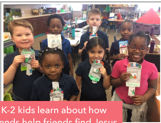
K-2 kids learn about how friends help friends find Jesus

thing up and the design was on the shirt. Then they put it on a big thing [conveyor belt] that dries it because it's hot inside it [630 degrees].