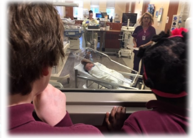
Top right: the nursery