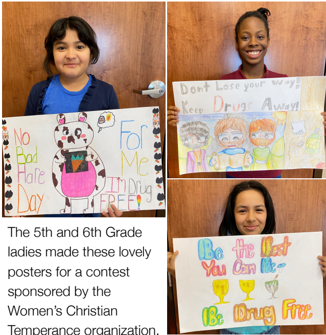
The 5th and 6th Grade ladies made these lovely posters for a contest sponsored by the Women's Christian Temperance organization.