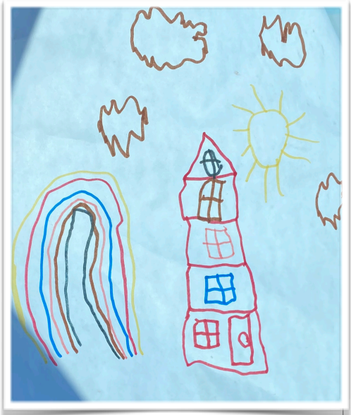
"A Rainbow at the House"

If I had a store, I'd sell chickens, eggs, and pickles.